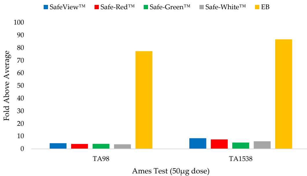
Figure 2. Carcinogenicity test results for SafeView™ series and ethidium bromide (EB) at 50µg dose; all products were tested on two Salmonella typhimurium strains: TA98 and TA1538.